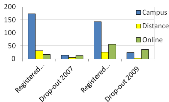
Figure 1. Number of registered students on degree project course and number of dropouts in 2007 and 2009.